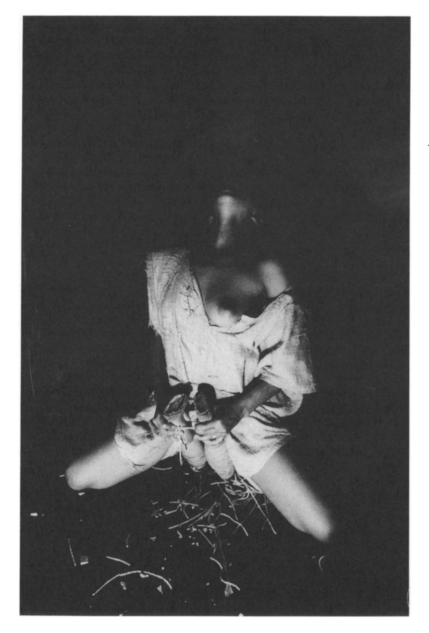
1. Teatro Obstáculo's Monodrama La cuarta pared (directed by Victor Varela, Havana, 1993) was an adaptation of the groundbreaking 1987 version, which spoke, without words, about frustrations and lack of liberty because, as its director said then, "In Cuba People are dying of security."

Entrance into the theatres was by no means guaranteed. The lines outside were very long, perhaps comparable to a film premiere here in the U.S. Although most spaces were filled to capacity and beyondpeople stood up or sat on the floor in the smaller spaces-the international guests rarely had any problems of entry. Some theatres had separate reserved seating; others had different lines for different color badges. At times, this became a problem if you were attending a show with a Cuban colleague. For some of us, this hospitality and special treatment was embarrassing. Even if we arrived at the last minute, via special buses or taxis, we were able to go ahead of the Cubans in line, most of whom had arrived on foot or bicycle.