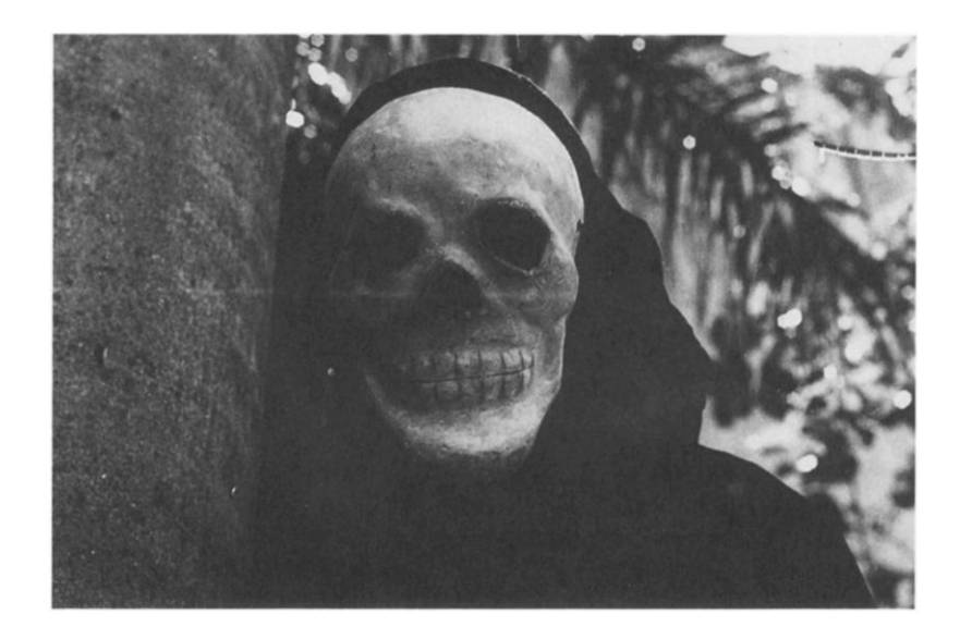
11. Death peeks at the audience from behind a tree (Patakin de una muñeca negra, Havana, 1993).