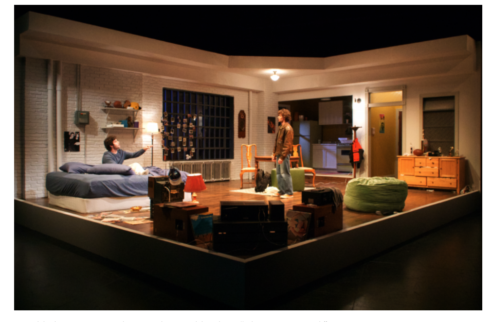
Troubled Twenty somethings Take A Wild Ride In "This Is Our Youth" August 18,2022\,