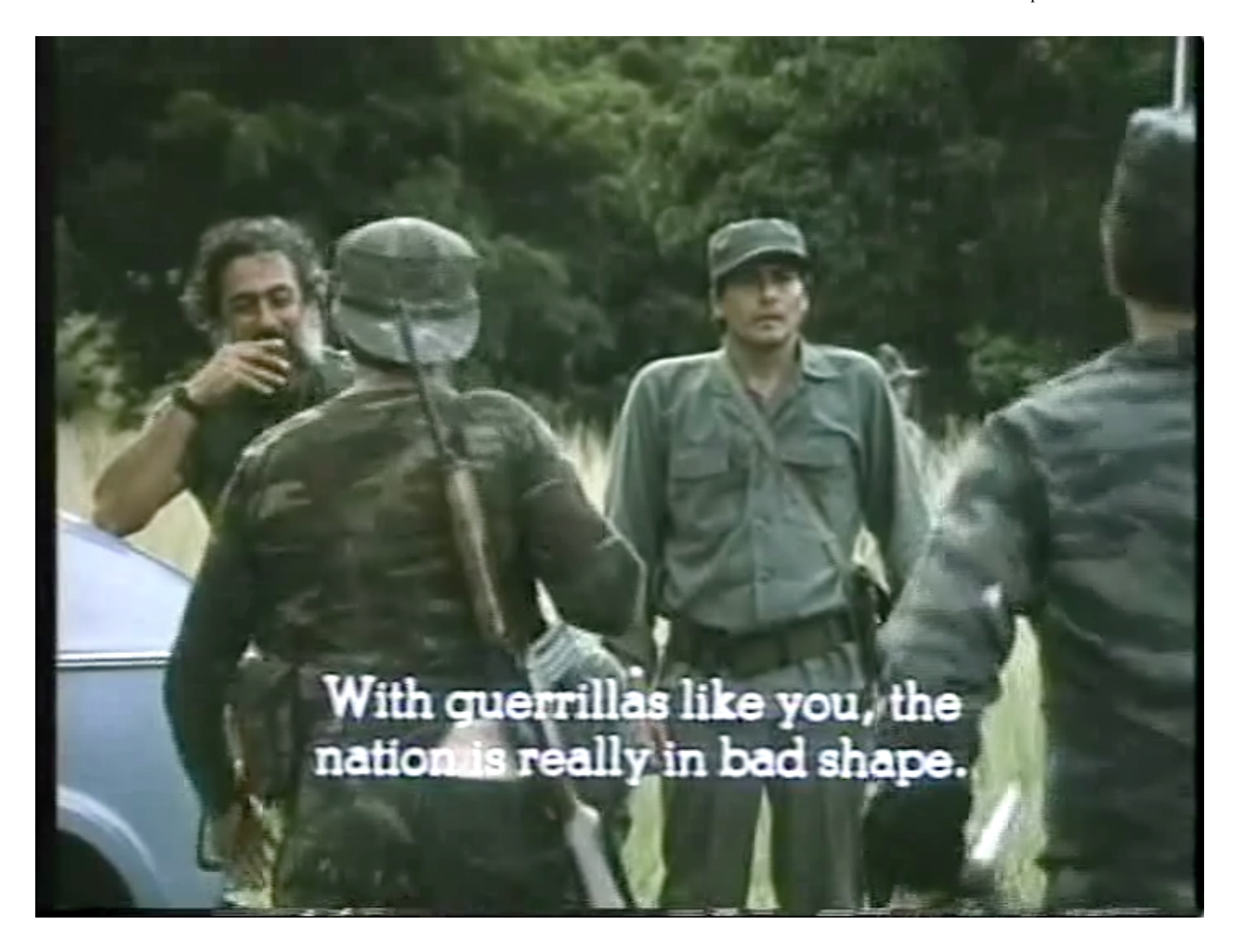
'Con guerrilleros como ustedes la patria está muy jodida.' Film still.

IA: Yes, as I said before Amigos is a bittersweet comedy drama, full of choteo , Cuban humor. We all know Cuban machismo ; I have seen it and experienced it all my life. You see, the revolution was the greatest promoter of machismo . All those bearded, sweaty, cigar smokers and trigger-happy militiamen impregnated the macho image—an image the maximum leader always projected and demanded among revolutionary militants. Hundreds of homosexuals were sent to prisons and to hard-labor concentrations camps, las UMAP , just for not